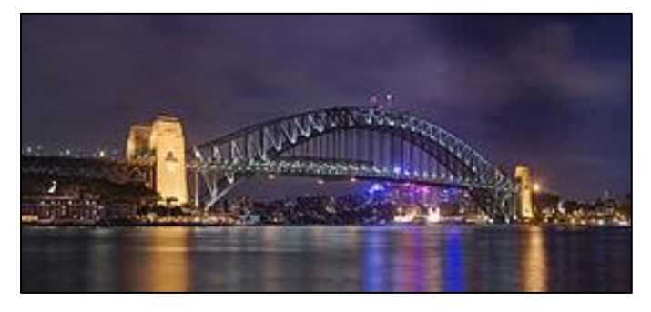
Sydney Harbour Bridge